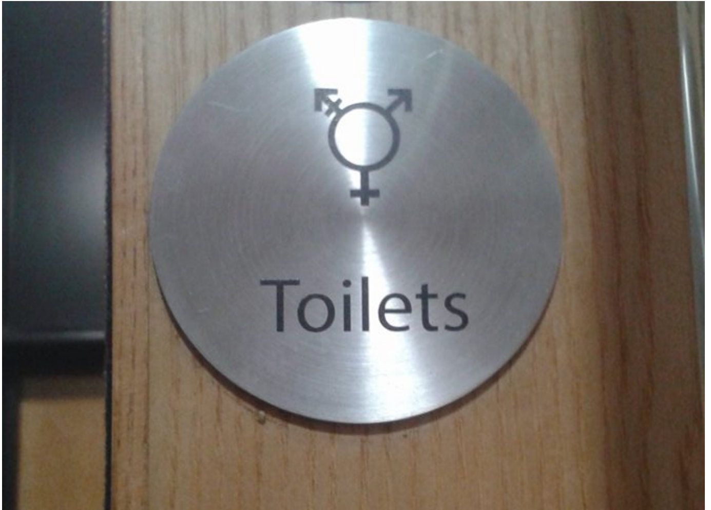
Image 3. Sign at Wadham, with the transgender symbol, labelled 'Toilets'.