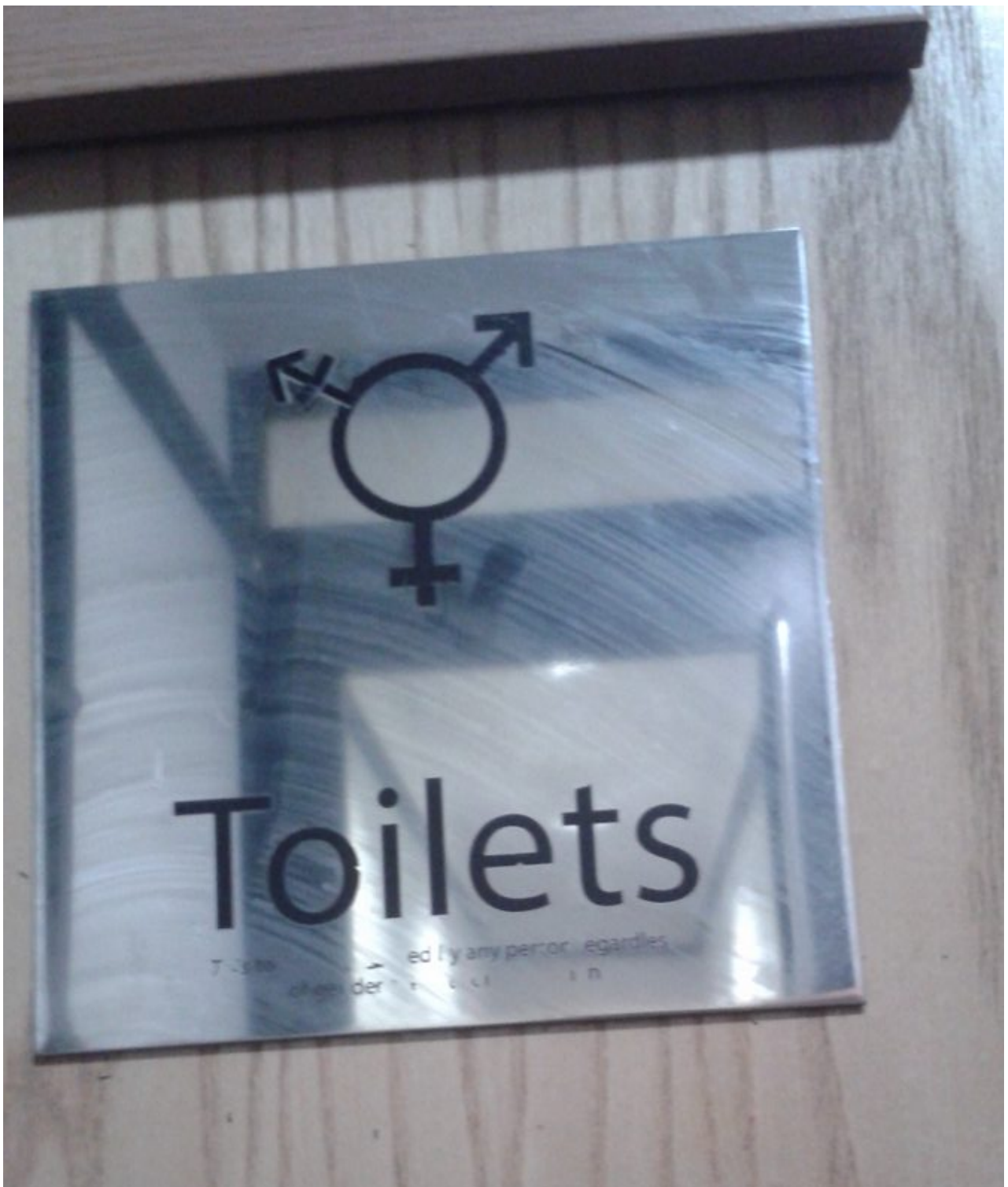
Image 2. Sign at Wadham, the same as that in Image 1.