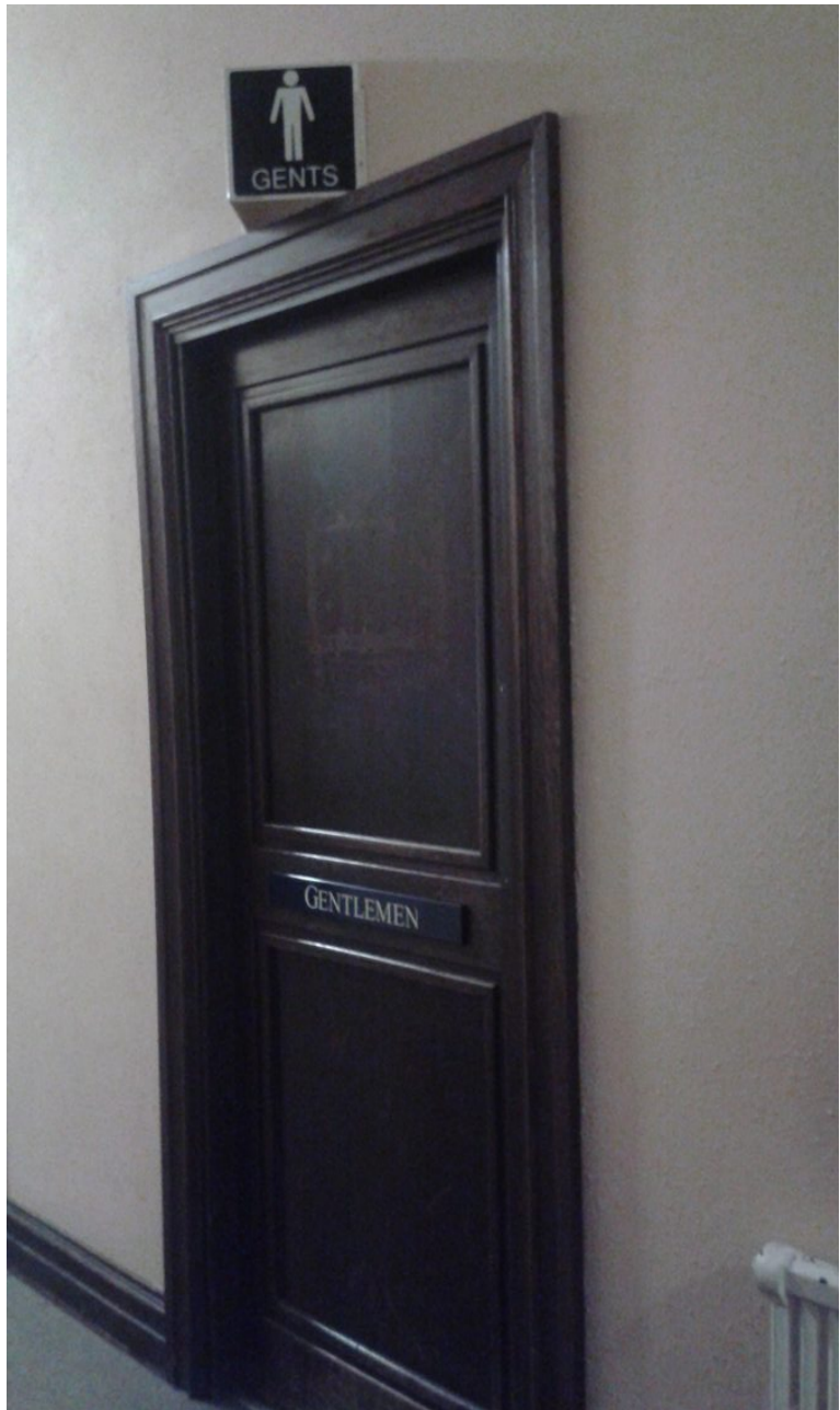
Image 7 and 8. The signage in Deneke East ground floor. Left: labelled 'LADIES'; right: labelled 'GENTLEMEN' with an image of a man and 'GENTS' above the door.