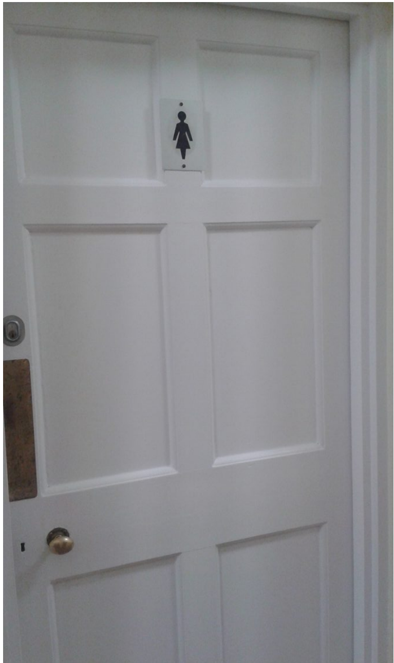
Image 9 and 10. Signage in Wordsworth ground floor. Left: image of a man; right: image of a woman.