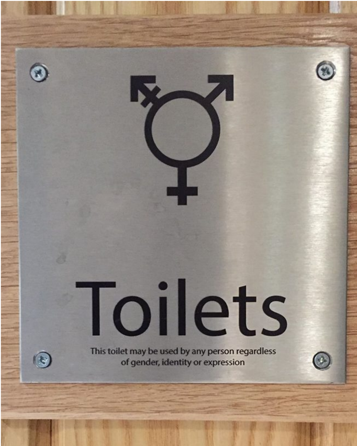
Image 1. Sign at Brasenose, with the transgender symbol, labelled 'Toilets. This toilet may be used by any person regardless of gender, identity or expression.'