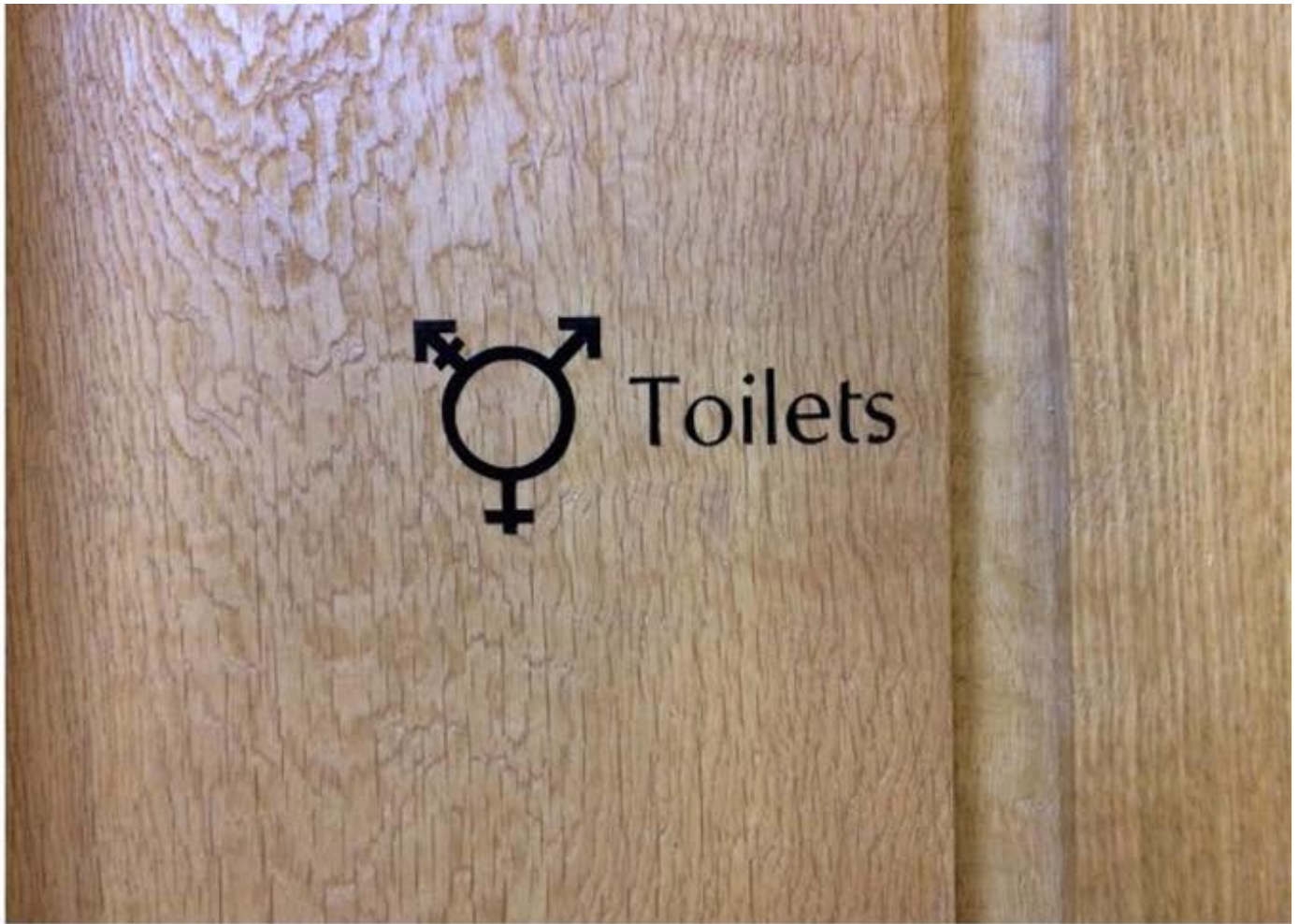
Image 4. Sign at St Catherine's, with the transgender symbol, labelled 'Toilets'.