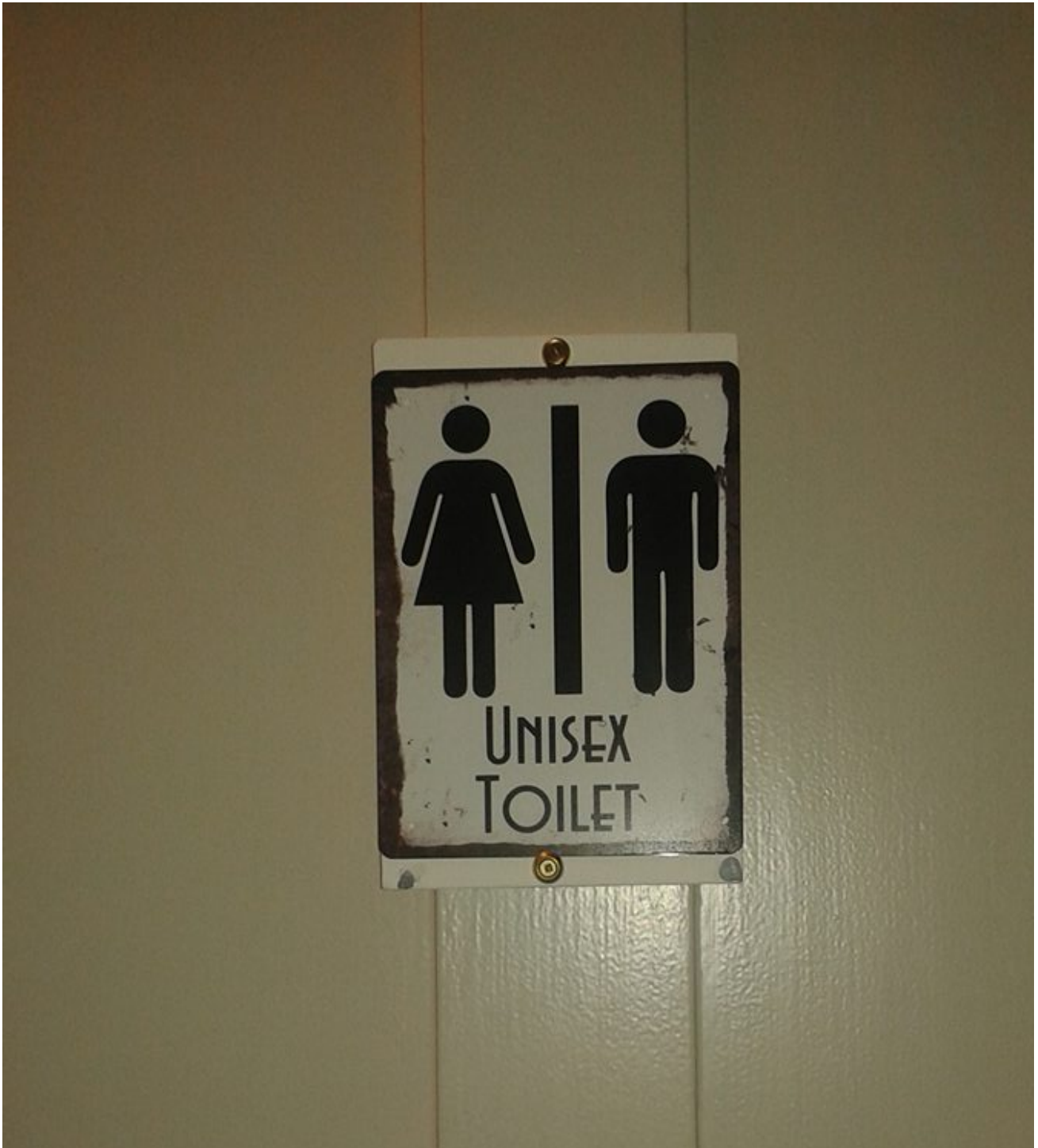
Image 6. The current signage in LMH bar, with a picture of a woman and a man, labelled 'UNISEX TOILET'.