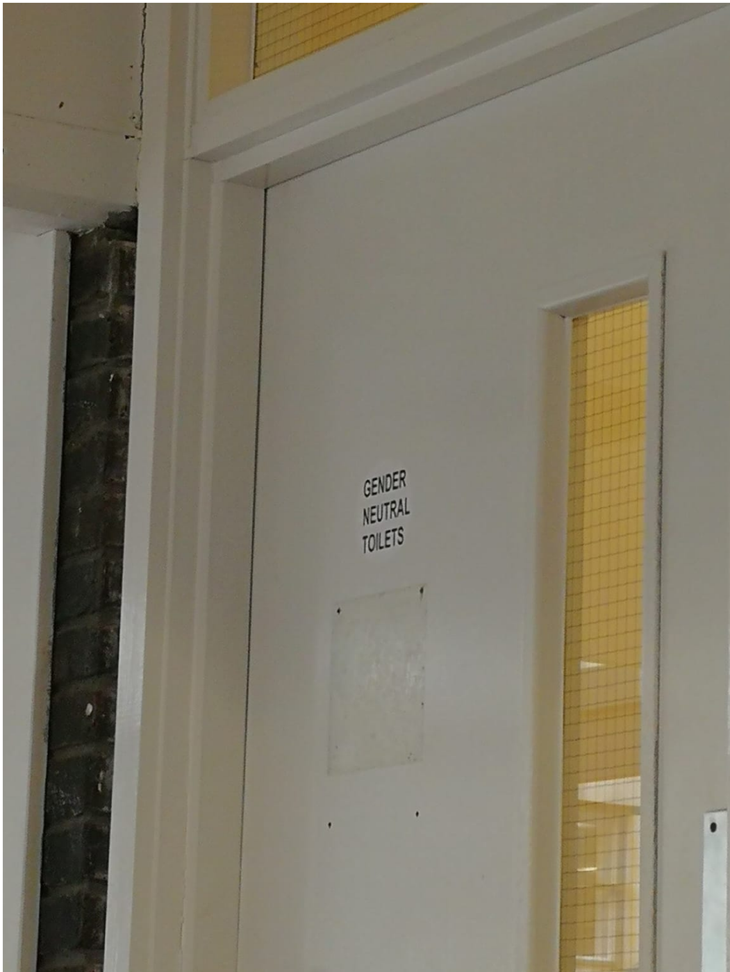
Image 5. Sign at Somerville, labelled 'GENDER NEUTRAL TOILETS.'